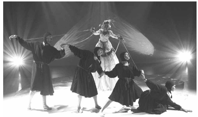
Motus O dance theatre

Don't miss your chance – get involved and get noticed! call OC today at 416.703.6709 • 1.866.209.0982