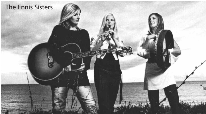
The Ennis Sisters

ONTARIO ARTS COUNCIL CONSEIL DES ARTS DE L'ONTARIO