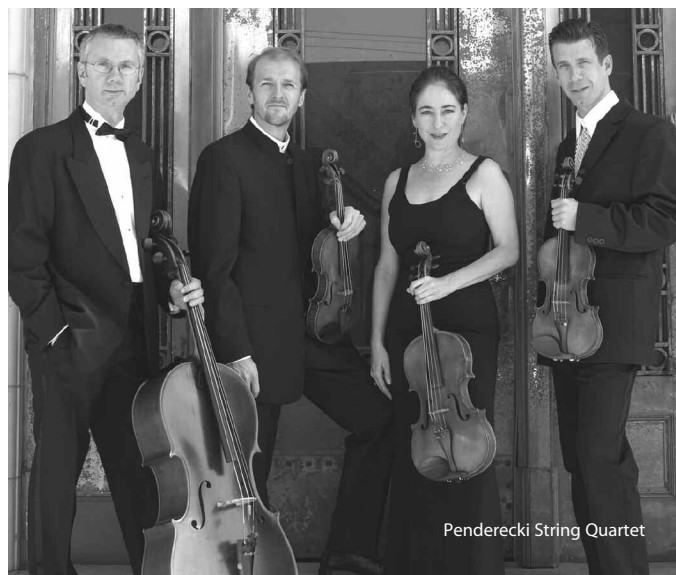
Penderecki String Quartet